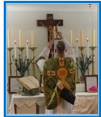
The Hiding Mass in Van Nuys

If you are unsure how to correctly set your hand missal arrive early for Holy Mass and ask the Monsignor to assist you. It is also important to become familiar with the Ordinary of the Mass , those parts that never change, i.e.: Kyrie, Gloria, Creed, Sanctus, Benedictus, and the Agnus Dei. And of course the Canon of the Mass, and the Propers of the Mass , those which vary according to the feasts of the day, i.e., Introit, Collect(s) (after the Gloria or Dominus Vobiscum), Epistle, Gradual, Alleluia, Tract or Sequence, Gospel, Secret, Communion Verse and Post Communion. On many feasts or days there are Commemorations (additional prayers) at the Collect, Secret and Postcommunion. The careful attention to these prayers and readings will help one enter into a deeper spiritual relationship with the Holy Liturgy, the Saints and Mysteries of God.