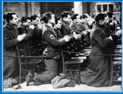
Real Men Kneel at Holy Mass!