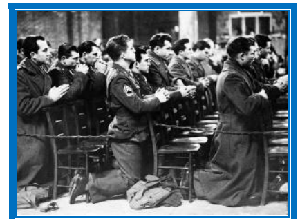
Real Men Kneel at Holy Mass!