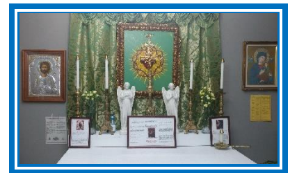
The Hiding Mass in Van Nuys

the Ordinary of the Mass , those parts that never change, i.e.: Kyrie, Gloria, Creed, Sanctus, Benedictus, and the Agnus Dei. And of course the Canon of the Mass, and the Propers of the Mass , those which vary according to the feasts of the day, i.e., Introit, Collect(s) (after the Gloria or Dominus Vobiscum), Epistle, Gradual, Alleluia, Tract or Sequence, Gospel, Secret, Communion Verse and Post Communion. On many feasts or days there are Commemorations (additional prayers) at the Collect, Secret and Postcommunion. The careful attention to these prayers and readings will help one enter into a deeper spiritual relationship with the Holy Liturgy, the Saints and Mysteries of God.