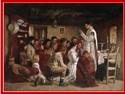
The Hiding Mass in Ireland

Postcommunion. The careful attention to these prayers and readings will help one enter into a deeper spiritual relationship with the Holy Liturgy, the Saints and Mysteries of God.