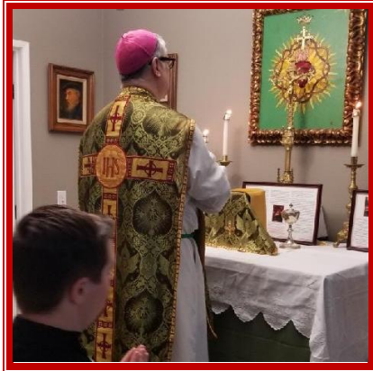
The Hiding Mass in Van Nuys

Sunday Mass Time: (please call or email for current Mass time and location)