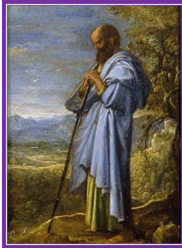
S. Paul in prayer.

A: Such a good question, which underlines the importance of reading the Holy Bible on a regular basis and getting a firm understanding of its meaning: In 2 Corinthians 2:7 - 9 we read that the Apostle was given a "sting in his flesh," that is, a great temptation. He begs God for the removal of the temptation but God allows the temptation to remain so that S. Paul might be perfected. God's grace will help us overcome all sin and temptation: this is our "work" - to be perfected by God's grace, not have our temptation to sin just "disappear" - we must participate and cooperate with God's grace in dying to sin.