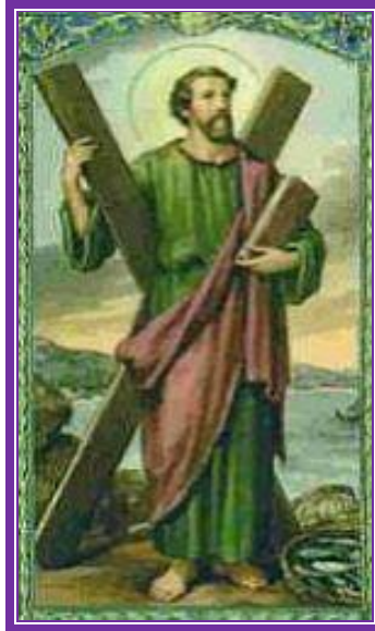
Saint Andrew (30 th of November): Pray for us!