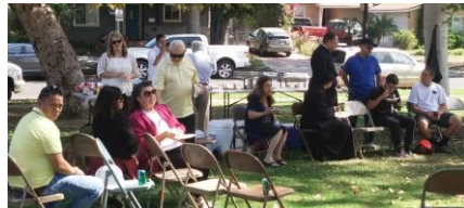
Everyone sitting down and getting ready for all the goodies...