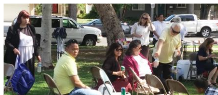
As long as the ladies of the Oratory are supervising everything will be alright!