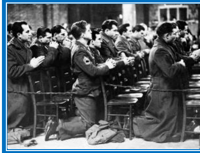
Real Men Kneel at Holy Mass!