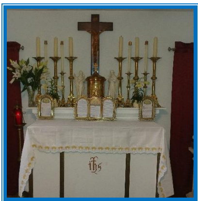
The Hiding Mass in Van Nuys

If you are unsure how to correctly set your hand missal arrive early for Holy Mass and ask the Monsignor to assist you. It is also important to become familiar with the Ordinary of the Mass , those parts that never change, i.e.: Kyrie, Gloria, Creed, Sanctus, Benedictus, and the Agnus Dei. And of course the Canon of the Mass, and the Propers of the Mass , those which vary according to the feasts of the day, i.e., Introit, Collect(s)(after the Gloria or Dominus Vobiscum), Epistle, Gradual, Alleluia, Tract or Sequence, Gospel, Secret, Communion Verse and Post Communion. On many feasts or days there are Commemorations (additional prayers) at the Collect, Secret and Postcommunion. The careful attention to these prayers and readings will help one enter into a deeper spiritual relationship with the Holy Liturgy, the Saints and Mysteries of God.