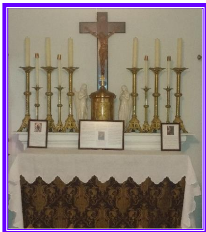
The Hiding Mass in Van Nuys