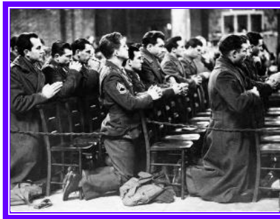
Real Men Kneel at Holy Mass!