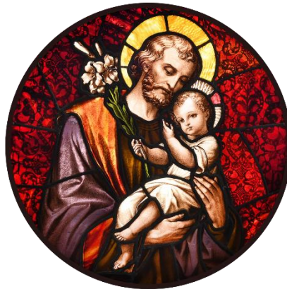
S. Joseph: 19 March Pray for us!

Gloria, Creed, Sanctus, Benedictus, and the Agnus Dei. And of course the Canon of the Mass, and the Propers of the Mass , those which vary according to the feasts of the day, i.e., Introit, Collect(s)(after the Gloria or Dominus Vobiscum), Epistle, Gradual, Alleluia, Tract or Sequence, Gospel, Secret, Communion Verse and Post Communion. On many feasts or days there are Commemorations (additional prayers) at the Collect, Secret and Postcommunion. The careful attention to these prayers and readings will help one enter into a deeper spiritual relationship with the Holy Liturgy, the Saints and Mysteries of God.