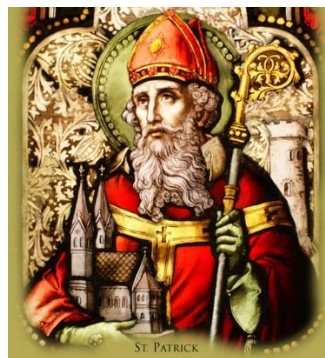
S. Patrick: 17 March Pray for us!