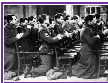
Real Men Kneel at Holy Mass!