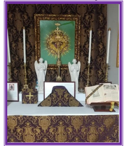
The Hiding Mass in Van Nuys