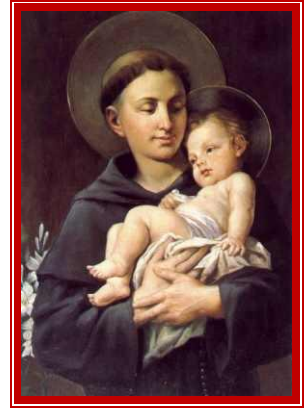
S. Anthony of Padua 13 th of June: Pray for us!