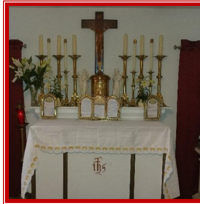
The Hiding Mass in Van Nuys

the Canon of the Mass, and the Propers of the Mass , those which vary according to the feasts of the day, i.e., Introit, Collect(s) (after the Gloria or Dominus Vobiscum), Epistle, Gradual, Alleluia, Tract or Sequence, Gospel, Secret, Communion Verse and Post Communion. On many feasts or days there are Commemorations (additional prayers) at the Collect, Secret and Postcommunion. The careful attention to these prayers and readings will help one enter into a deeper spiritual relationship with the Holy Liturgy, the Saints and Mysteries of God.