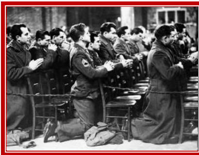
Real Men Kneel at Holy Mass!