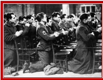
Real Men Kneel at Holy Mass!