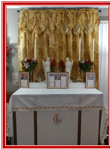
The Hidden Mass in Van Nuys

the Mass , those which vary according to the feasts of the day, i.e., Introit, Collect(s)(after the Gloria or Dominus Vobiscum), Epistle, Gradual, Alleluia, Tract or Sequence, Gospel, Secret, Communion Verse and Post Communion. On many feasts or days there are Commemorations (additional prayers) at the Collect, Secret and Postcommunion. The careful attention to these prayers and readings will help one enter into a deeper spiritual relationship with the Holy Liturgy, the Saints and Mysteries of God.