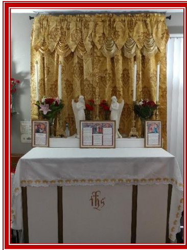
The Hidden Mass in Van Nuys

If you are unsure how to correctly set your hand missal arrive early for Holy Mass and ask the Monsignor to assist you. It is also important to become familiar with the Ordinary of the Mass , those parts that never change, i.e.: Kyrie, Gloria, Creed, Sanctus, Benedictus, and the Agnus Dei. And of course the Canon of the Mass, and the Propers of the Mass , those which vary according to the feasts of the day, i.e., Introit, Collect(s)(after the Gloria or Dominus Vobiscum), Epistle, Gradual, Alleluia, Tract or Sequence, Gospel, Secret, Communion Verse and Post Communion. On many feasts or days there are Commemorations (additional prayers) at the Collect, Secret and Postcommunion. The careful attention to these prayers and readings will help one enter into a deeper spiritual relationship with the Holy Liturgy, the Saints and Mysteries of God.