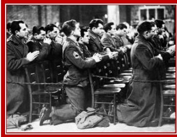
Real Men Kneel at Holy Mass!