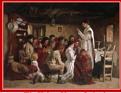
The Hiding Mass in Ireland,

Sunday Mass Time: (please call or email for current Mass time and location)