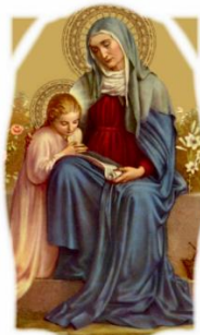
S. Anne: Pray for us!

If you are unsure how to correctly set your hand missal arrive early for Holy Mass and ask the Monsignor to assist you. It is also important to become familiar with the Ordinary of the Mass , those parts that never change, i.e.: Kyrie, Gloria, Creed, Sanctus, Benedictus, and the Agnus Dei. And of course the Canon of the Mass, and the Propers of the Mass , those which vary according to the feasts of the day, i.e., Introit, Collect(s)(after the Gloria or Dominus Vobiscum), Epistle, Gradual, Alleluia, Tract or Sequence, Gospel, Secret, Communion Verse and Post Communion. On many feasts or days there are Commemorations (additional prayers) at the Collect, Secret and Postcommunion. The careful attention to these prayers and readings will help one enter into a deeper spiritual relationship with the Holy Liturgy, the Saints and Mysteries of God.