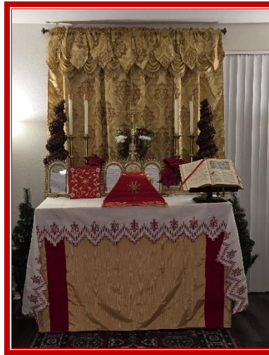
The Hiding Mass in Van Nuys