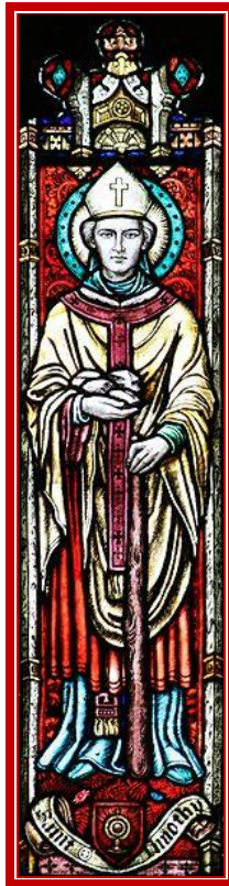
S. Timothy, Bishop & Martyr 25 January: Pray for us!