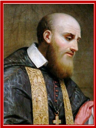
S. Francis de Sales 29 January: Pray for us!

If you are unsure how to correctly set your hand missal arrive early for Holy Mass and ask the Monsignor to assist you. It is also important to become familiar with the Ordinary of the Mass , those parts that never change, i.e.: Kyrie, Gloria, Creed, Sanctus, Benedictus, and the Agnus Dei. And of course the Canon of the Mass, and the Propers of the Mass , those which vary according to the feasts of the day, i.e., Introit, Collect(s)(after the Gloria or Dominus Vobiscum), Epistle, Gradual, Alleluia, Tract or Sequence, Gospel, Secret, Communion Verse and Post Communion. On many feasts or days there are Commemorations (additional prayers) at the Collect, Secret and Postcommunion. The careful attention to these prayers and readings will help one enter into a deeper spiritual relationship with the Holy Liturgy, the Saints and Mysteries of God.