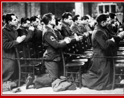
Real Men Kneel at Holy Mass!