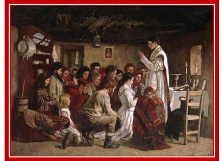
The Hiding Mass in Ireland