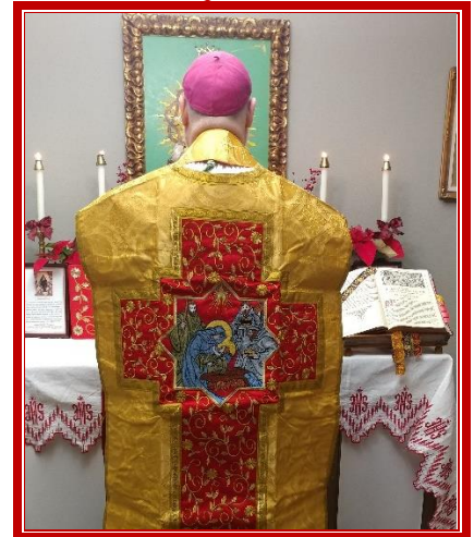
The Hiding Mass in Van Nuys

Sunday Mass Time: (please call or email for current Mass time and location)