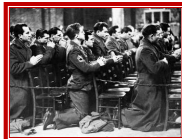
Real men kneel at Holy Mass!