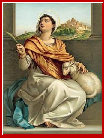
S. Agnes (21 st of January): Pray for us!