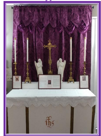
The Hiding Mass in Van Nuys