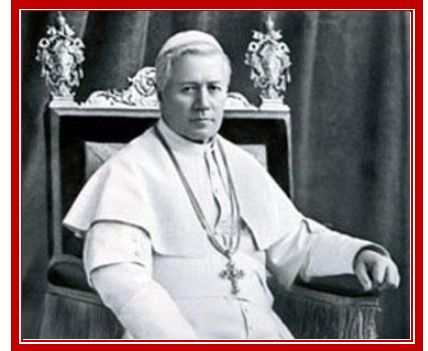
Saint Francis Exchange

W HERE is the road which leads us to Jesus Christ? It is before our eyes: it is the Church. It is our duty to recall to everyone, great and small, the absolute necessity we are under to have recourse to this Church in order to work out our eternal salvation.