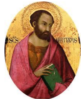
S. Matthias, Apostle: 24 February Pray for us!

day, i.e., Introit, Collect(s)(after the Gloria or Dominus Vobiscum), Epistle, Gradual, Alleluia, Tract or Sequence, Gospel, Secret, Communion Verse and Post Communion. On many feasts or days there are Commemorations (additional prayers) at the Collect, Secret and Postcommunion. The careful attention to these prayers and readings will help one enter into a deeper spiritual relationship with the Holy Liturgy, the Saints and Mysteries of God.