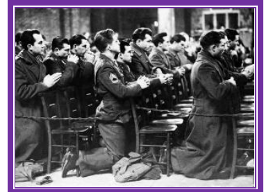
Real Men Kneel at Holy Mass!