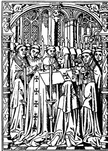
“Burying” the Alleluia

Missa Est is replaced by the Benedicamus Dómino – Let us bless the Lord). A wonderful tradition of this season is the Burying of the Alleluia . At the office of Vespers (Evening Prayer) the praying, or singing, of the Alleluia is done so quite solemnly, afterwards the clergy, accompanied by the faithful, “bury” the Alleluia by the use of a scroll or plaque with ALLELUIA written on it in either the churchyard or another appropriate “resting place” and then it is “resurrected” on Holy Saturday, the Vigil of Easter .