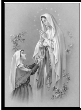
Our Lady of Lourdes (11 th of February): Pray for us!