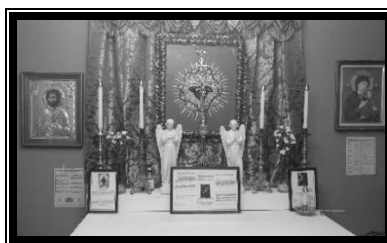
The Hiding Mass in Van Nuys