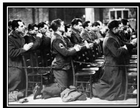
Real Men Kneel at Holy Mass!