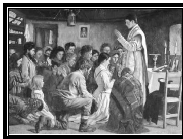
The Hiding Mass in Ireland

If you are unsure how to correctly set your hand missal arrive early for Holy Mass and ask the Monsignor to assist you. It is also important to become familiar with the Ordinary of the Mass , those parts that never change, i.e.: Kyrie, Gloria, Creed, Sanctus, Benedictus, and the Agnus Dei. And of course the Canon of the Mass, and the Propers of the Mass , those which vary according to the feasts of the day, i.e., Introit, Collect(s) (after the Gloria or Dominus Vobiscum), Epistle, Gradual, Alleluia, Tract or Sequence, Gospel, Secret, Communion Verse and Post Communion. On many feasts or days there are Commemorations (additional prayers) at the Collect, Secret and Postcommunion. The careful attention to these prayers and readings will help one enter into a deeper spiritual relationship with the Holy Liturgy, the Saints and Mysteries of God.