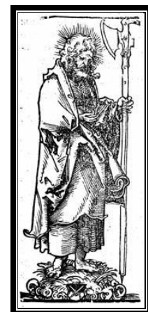
St. Matthias, Apostle (24 th of February): Pray for us!

Your continued support is appreciated and quite needed to continue our mission of offer the true and traditional Latin Mass of the Holy Catholic Church. The true Mass and Faith are ours to protect, defend and support!