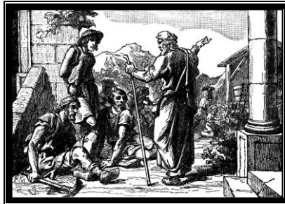
Why stand you here all the day idle? S. Matthew 20:6

a proper garden, the Alleluia is “buried” under the altar cloths, since they represent the burial cloths of Christ. Even if our chapels and churches are small or “hidden” we must always do as much as we can to keep the Holy Liturgy of the Church as solemn and dignified as possible. Remember, the Holy Mass is the most beautiful thing this side of heaven . We must never allow ourselves to give God anything less than our best; like Abel the Just , no sacrifice is too good for the honour and glory of Almighty God. Even in our “hidden” Mass centre we come together to give proper and true worship to the honour and glory of God!