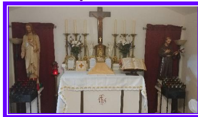
Our little Oratory on the feast of Christ the King