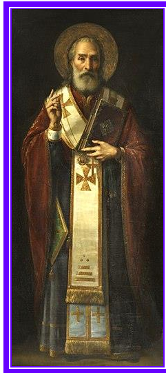
S. Nicholas: Pray for us! 6th of December