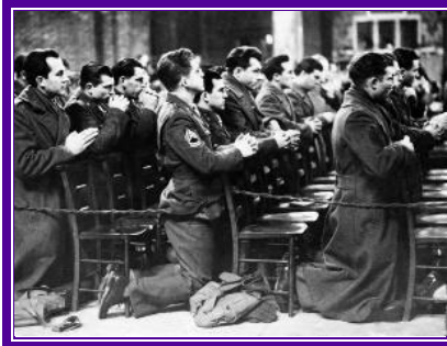
Real Men Kneel at Holy Mass!