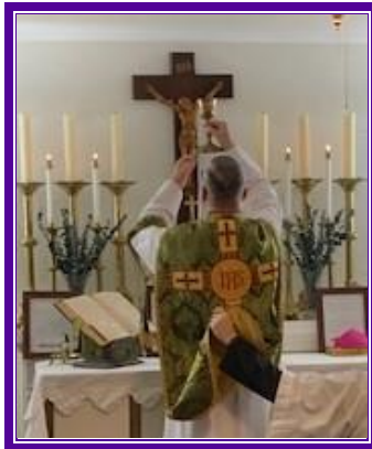
The Hiding Mass in Van Nuys

If you are unsure how to correctly set your hand missal arrive early for Holy Mass and ask the Monsignor to assist you. It is also important to become familiar with the Ordinary of the Mass , those parts that never change, i.e.: Kyrie, Gloria, Creed, Sanctus, Benedictus, and the Agnus Dei. And of course the Canon of the Mass, and the Propers of the Mass , those which vary according to the feasts of the day, i.e., Introit, Collect(s)(after the Gloria or Dominus Vobiscum), Epistle, Gradual, Alleluia, Tract or Sequence, Gospel, Secret, Communion Verse and Post Communion. On many feasts or days there are Commemorations (additional prayers) at the Collect, Secret and Postcommunion. The careful attention to these prayers and readings will help one enter into a deeper spiritual relationship with the Holy Liturgy, the Saints and Mysteries of God.