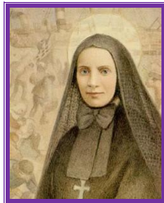
S. Frances Xavier Cabrini: Pray for us! 22 December