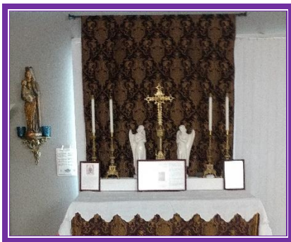
The Hiding Mass in Van Nuys

If you are unsure how to correctly set your hand missal arrive early for Holy Mass and ask the Monsignor to assist you. It is also important to become familiar with the Ordinary of the Mass , those parts that never change, i.e.: Kyrie, Gloria, Creed, Sanctus, Benedictus, and the Agnus Dei. And of course the Canon of the Mass, and the Propers of the Mass , those which vary according to the feasts of the day, i.e., Introit, Collect(s)(after the Gloria or Dominus Vobiscum), Epistle, Gradual, Alleluia, Tract or Sequence, Gospel, Secret, Communion Verse and Post Communion. On many feasts or days there are Commemorations (additional prayers) at the Collect, Secret and Postcommunion. The careful attention to these prayers and readings will help one enter into a deeper spiritual relationship with the Holy Liturgy, the Saints and Mysteries of God.