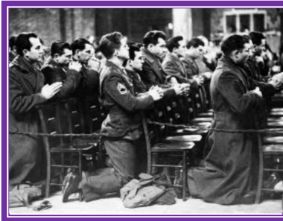
Real Men Kneel at Holy Mass!