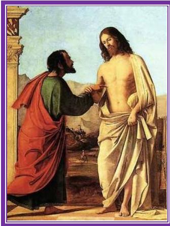
S. Thomas the Apostle: Pray for us! 21 December