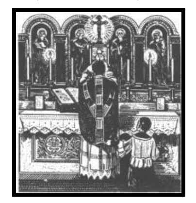
Saint Francis Exchange

We would like to remind those who send Mass requests to PLEASE include the name of the person and/or intention with your stipend. Mass Cards will be sent to concerned parties upon request. Thank you and God bless you!