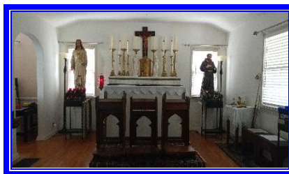
The Hidden Mass in Van Nuys

If you are unsure how to correctly set your hand missal arrive early for Holy Mass and ask the Monsignor to assist you. It is also important to become familiar with the Ordinary of the Mass , those parts that never change, i.e.: Kyrie, Gloria, Creed, Sanctus, Benedictus, and the Agnus Dei. And of course the Canon of the Mass, and the Propers of the Mass , those which vary according to the feasts of the day, i.e., Introit, Collect(s)(after the Gloria or Dominus Vobiscum), Epistle, Gradual, Alleluia, Tract or Sequence, Gospel, Secret, Communion Verse and Post Communion. On many feasts or days there are Commemorations (additional prayers) at the Collect, Secret and Postcommunion. The careful attention to these prayers and readings will help one enter into a deeper spiritual relationship with the Holy Liturgy, the Saints and Mysteries of God.