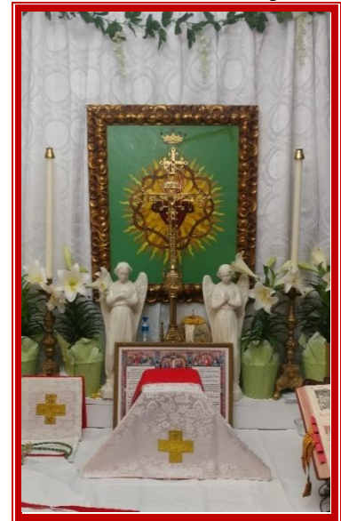
The Hiding Mass in Van Nuys