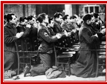
Real Men Kneel at Holy Mass!