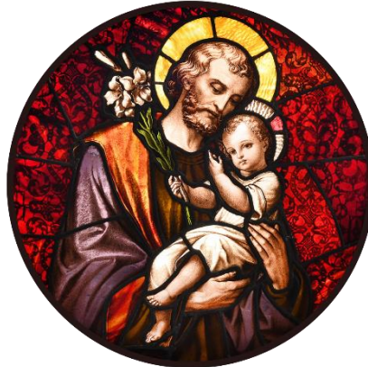
Solemnity of S. Joseph: 26 April Pray for us!

day, i.e., Introit, Collect(s)(after the Gloria or Dominus Vobiscum), Epistle, Gradual, Alleluia, Tract or Sequence, Gospel, Secret, Communion Verse and Post Communion. On many feasts or days there are Commemorations (additional prayers) at the Collect, Secret and Postcommunion. The careful attention to these prayers and readings will help one enter into a deeper spiritual relationship with the Holy Liturgy, the Saints and Mysteries of God.